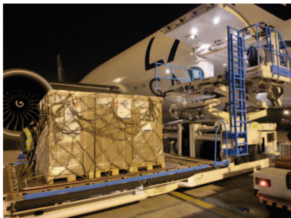
Plasmaderivatives shipment to Barcelona from Brasil.

Sales at the Hospital division, which concentrates non-biological pharmaceutical products used in hospital pharmacy, such as parenteral and enteral nutrition products and solutions, increased by 4.7% year-on-year to 86.3 MM euros. Despite budget restrictions at hospitals in Spain, the Hospital Logistics area, where Grifols is a name of reference, has benefited from the renewal of commercial agreements such as the one signed with Kardex Remstar. It is also worth noting, sales in the Medical Instruments and Nutrition areas increased over 8% each, as well as manufacturing for third-parties.