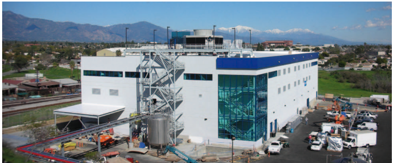
Flebogamma® DIF plant in Los Angeles, California.

Investments in the year also include the refurbishment work conducted at the group's new headquarters, acquired in 2008. The relocation of the various departments was completed in the final quarter of 2009.